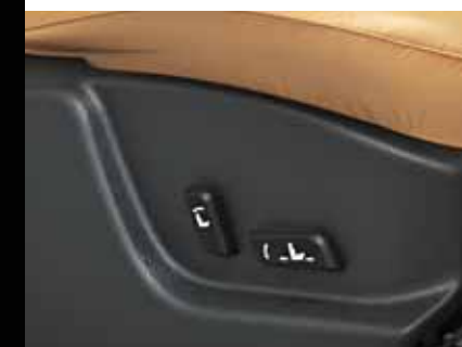
6-WAY POWER-ADJUSTABLE DRIVER'S SEAT

The dashboard and door trims have been fashioned with soft-touch, faux leather with fine stitch lines, elevating the interior's fit and finish by a few notches.