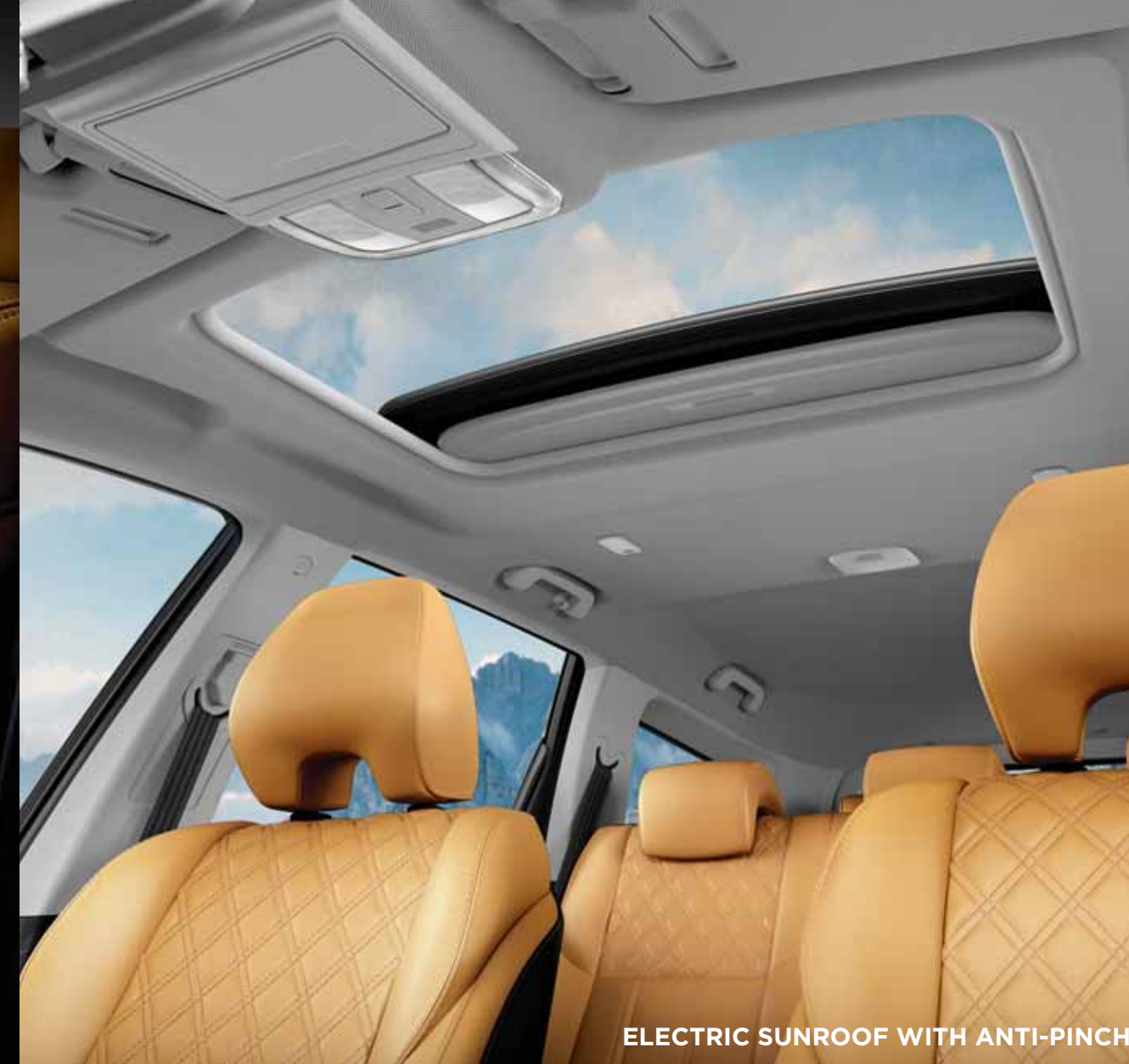
ELECTRIC SUNROOF WITH ANTI-PINCH

Step inside the new XUV500 and you can't help but feel pampered. The immaculate, soft-touch leather craftsmanship with fine stitch lines and piano black centre console add a dash of elegance to the dashboard. And the quilted, tan leather seats further accentuate this feeling of sophistication. But that's not all, look up and you will find the stunning electric sunroof with anti-pinch. Finally, the reduced noise levels, resulting in a much quieter in-cabin experience, ensures that even the most remote adventures, feel nothing short of 5-star extravagance.