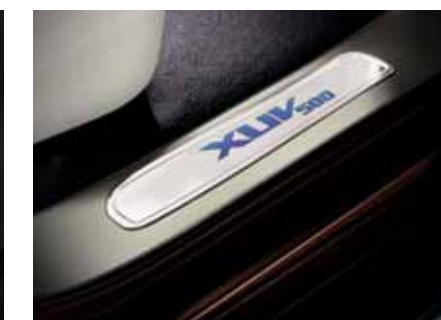
ILLUMINATED SCUFF PLATES