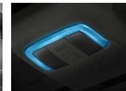
ICY-BLUE LOUNGE LIGHTING