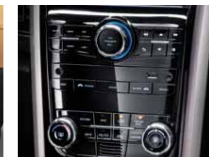
PIANO BLACK CENTRE CONSOLE