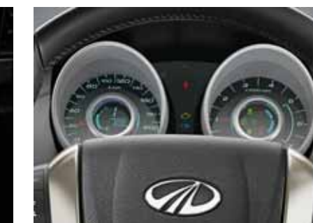
SPORTY TWIN POD CLUSTER