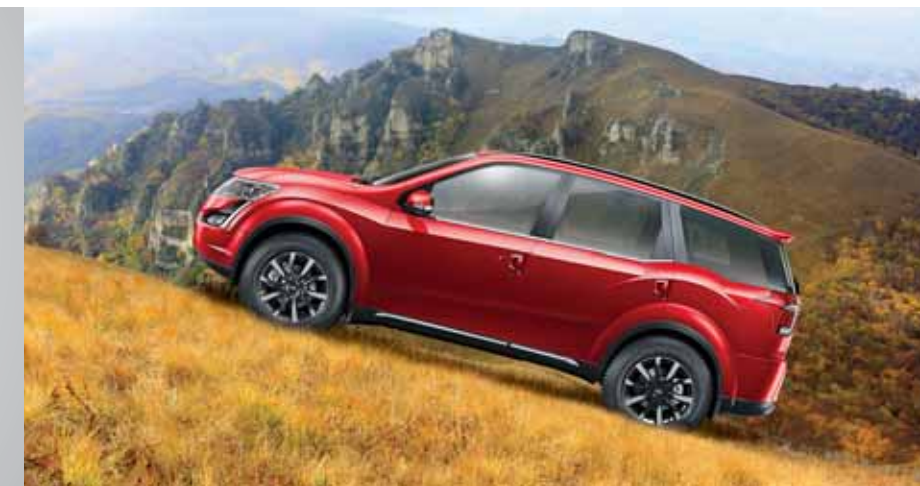
HILL DESCENT & HILL HOLD CONTROL