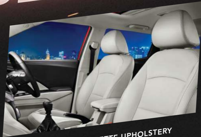
PREMIUM GREY LEATHERETTE UPHOLSTERY