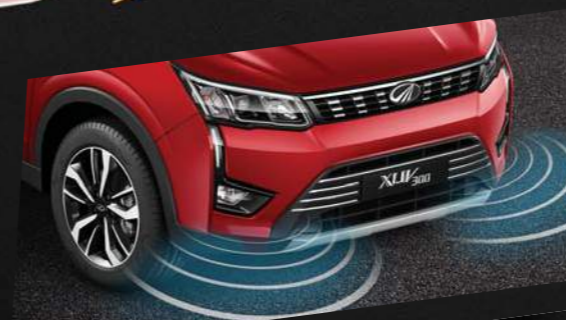
FIRST-IN-SEGMENT FRONT PARKING SENSORS