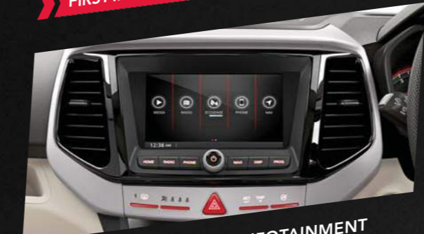
17.78 CM TOUCHSCREEN INFOTAINMENT WITH GPS NAVIGATION, APPLE CARPLAY & ANDROID AUTO™

The XUV300 allows you to adjust the air temperature to create separate, customised environments for the driver and front passenger. With 3 memory slots for your preferred setting, you won't waste time prepping up for your joyride.