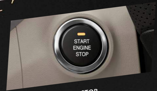
PUSH BUTTON START / STOP