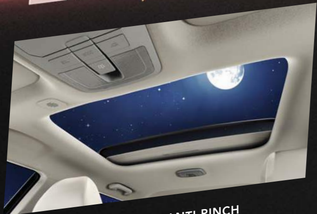
ELECTRIC SUNROOF WITH ANTI-PINCH