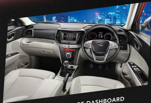
DUAL-TONE BLACK & BEIGE DASHBOARD