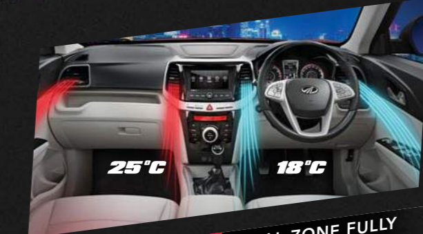
FIRST-IN-SEGMENT DUAL-ZONE FULLY AUTOMATIC TEMPERATURE CONTROL