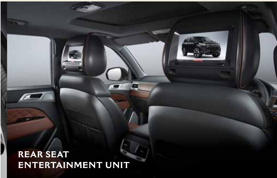
REAR SEAT ENTERTAINMENT UNIT

STATE-OF-THE-ART TECHNOLOGY, TO MATCH YOUR DRIVE FOR EXCELLENCE.