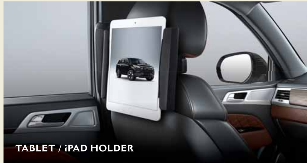
TABLET / iPad HOLDER