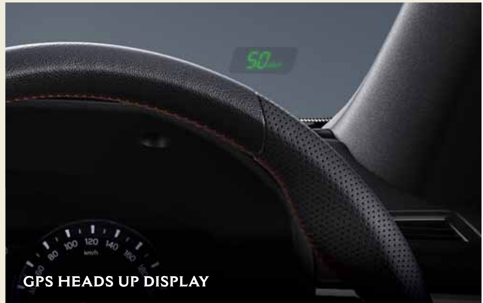
GPS HEADS UP DISPLAY